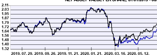
NET ASSET VALUE PER SHARE, 07/01/2019 - 06/30/2020

— Aegon Istanbul Equity Fund institutional series — Benchmark