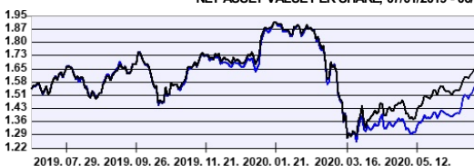
NET ASSET VALUE PER SHARE, 07/01/2019 - 06/30/2020

— Aegon Istanbul Equity Fund HUF series — Benchmark