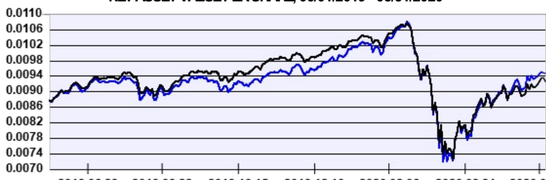
NET ASSET VALUE PER SHARE, 06/01/2019 - 05/31/2020

— Aegon MegaTrend Equity Fund of Funds EUR series — Benchmark