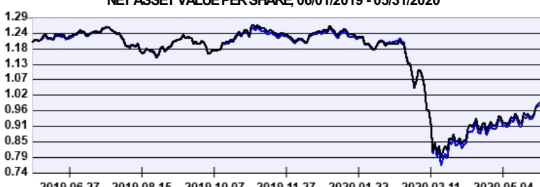
NET ASSET VALUE PER SHARE, 06/01/2019 - 05/31/2020

— Aegon Central European Equity Fund CZK series — Benchmark