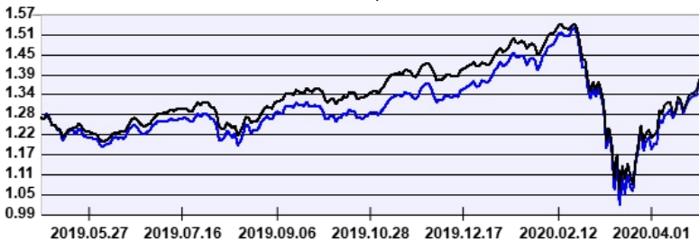
NET ASSET VALUE PER SHARE, 05/01/2019 - 04/30/2020

— Aegon MegaTrend Equity Fund of Funds HUF series — Benchmark