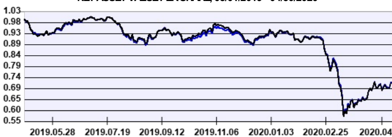
NET ASSET VALUE PER SHARE, 05/01/2019 - 04/30/2020

— Aegon Polish Equity Fund PLN series — Benchmark