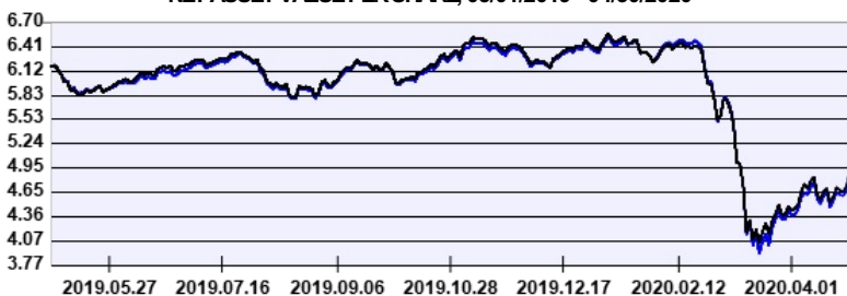
NET ASSET VALUE PER SHARE, 05/01/2019 - 04/30/2020

— Aegon Central European Equity Fund institutional series — Benchmark