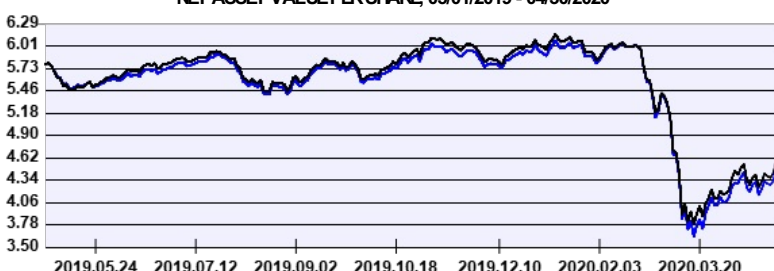
NET ASSET VALUE PER SHARE, 05/01/2019 - 04/30/2020

Past performance is no guarantee of future results. This report should not be considered as an offer or investment advisory. The Fund Prospectus contains the detailed conditions of the investment. The distribution costs of the fund purchase can be found at the distributors.