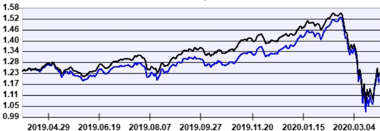
NET ASSET VALUE PER SHARE, 04/01/2019 - 03/31/2020

— Aegon MegaTrend Equity Fund of Funds HUF series — Benchmark