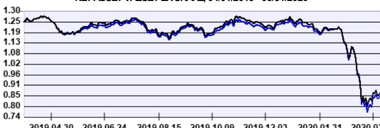
NET ASSET VALUE PER SHARE, 04/01/2019 - 03/31/2020

----- Aegon Central European Equity Fund CZK series ----- Benchmark