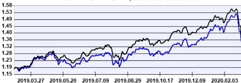
NET ASSET VALUE PER SHARE, 03/01/2019 - 02/29/2020

— Aegon MegaTrend Equity Fund of Funds HUF series — Benchmark