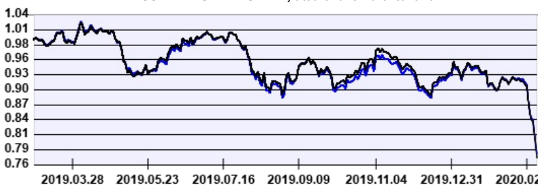
NET ASSET VALUE PER SHARE, 03/01/2019 - 02/29/2020

— Aegon Polish Equity Fund PLN series — Benchmark