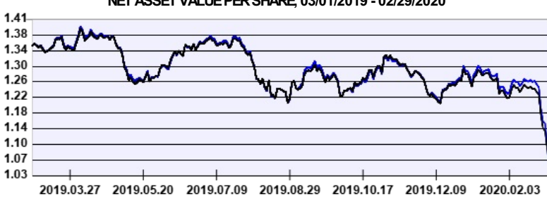
NET ASSET VALUE PER SHARE, 03/01/2019 - 02/29/2020

— Aegon Polish Equity Fund institutional series — Benchmark