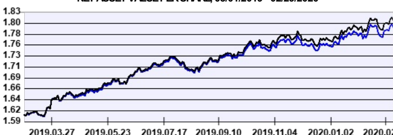
NET ASSET VALUE PER SHARE, 03/01/2019 - 02/29/2020

— Aegon Polish Bond Fund HUF series — Benchmark