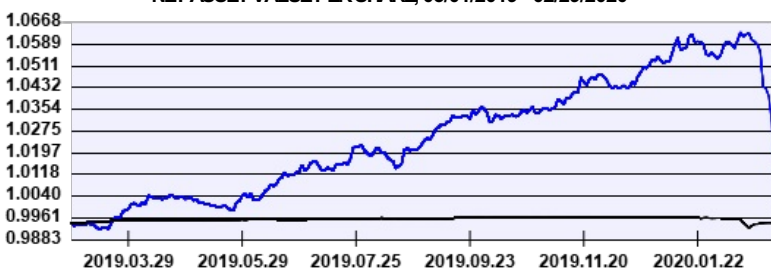
NET ASSET VALUE PER SHARE, 03/01/2019 - 02/29/2020

— Aegon Alfa Total Return Investment Fund EUR series — Benchmark Past performance is no guarantee of future results. This report should not be considered as an offer or investment advisory. The Fund Prospectus contains the detailed conditions of the investment. The distribution costs of the fund purchase can be found at the distributors.