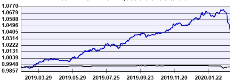
NET ASSET VALUE PER SHARE, 03/01/2019 - 02/29/2020

— Aegon Alfa Total Return Investment Fund CZK series — Benchmark