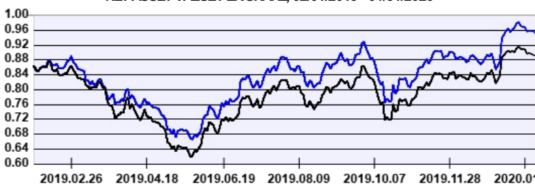
NET ASSET VALUE PER SHARE, 02/01/2019 - 01/31/2020

Past performance is no guarantee of future results. This report should not be considered as an offer or investment advisory. The Fund Prospectus contains the detailed conditions of the investment. The distribution costs of the fund purchase can be found at the distributors.