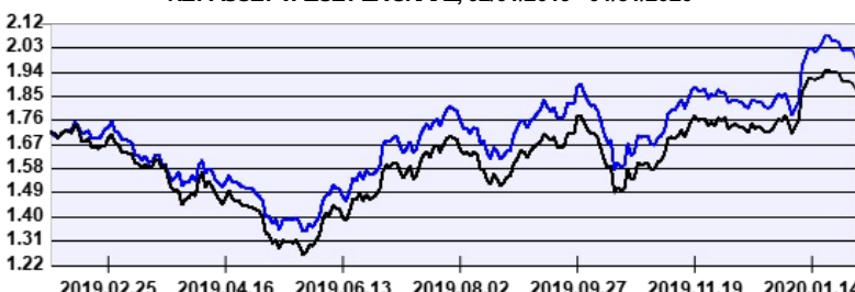
NET ASSET VALUE PER SHARE, 02/01/2019 - 01/31/2020

— Aegon IstanBull Equity Fund institutional series — Benchmark