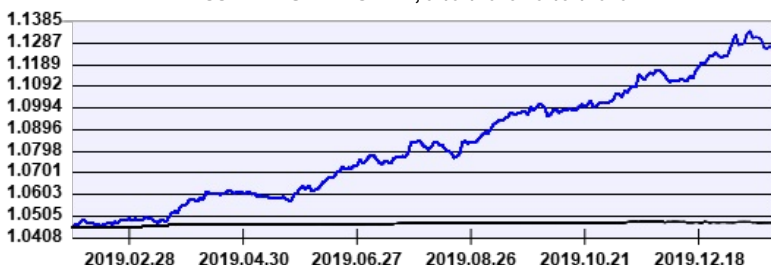
NET ASSET VALUE PER SHARE, 02/01/2019 - 01/31/2020

— Aegon Alfa Total Return Investment Fund institutional series — Benchmark