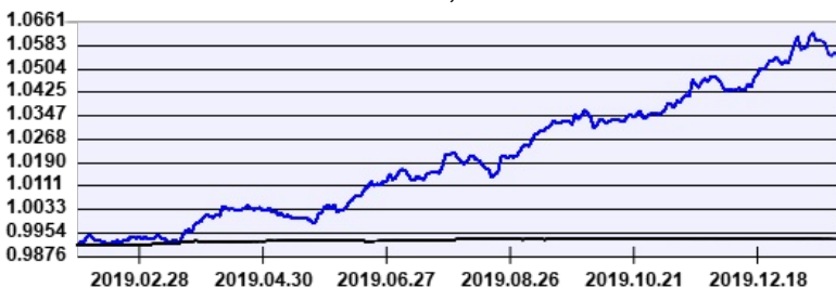
NET ASSET VALUE PER SHARE, 02/01/2019 - 01/31/2020

— Aegon Alfa Total Return Investment Fund EUR series — Benchmark