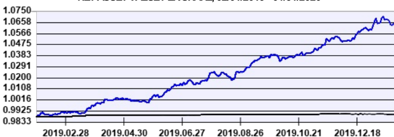
NET ASSET VALUE PER SHARE, 02/01/2019 - 01/31/2020

— Aegon Alfa Total Return Investment Fund CZK series — Benchmark