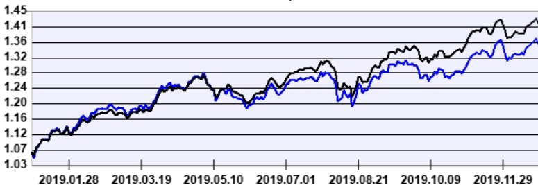
NET ASSET VALUE PER SHARE, 01/01/2019 - 12/31/2019

— Aegon MegaTrend Equity Fund of Funds HUF series — Benchmark