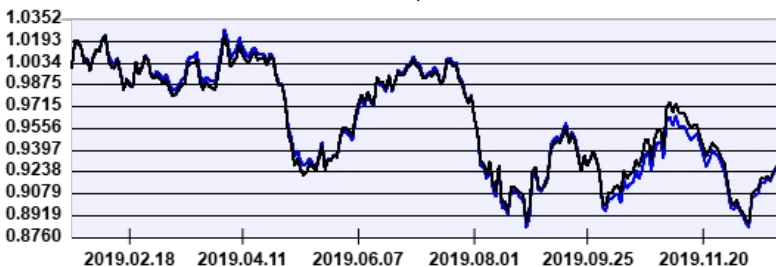
NET ASSET VALUE PER SHARE, 01/22/2019 - 12/31/2019

— Aegon Polish Equity Fund PLN series — Benchmark