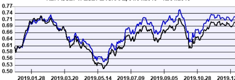
NET ASSET VALUE PER SHARE, 01/01/2019 - 12/31/2019

— Aegon Istanbul Equity Fund PLN series — Benchmark