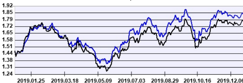
NET ASSET VALUE PER SHARE, 01/01/2019 - 12/31/2019

— Aegon Istanbul Equity Fund institutional series — Benchmark