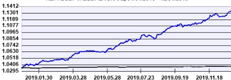
NET ASSET VALUE PER SHARE, 01/01/2019 - 12/31/2019

— Aegon Alfa Total Return Investment Fund USD series — Benchmark