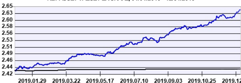
NET ASSET VALUE PER SHARE, 01/01/2019 - 12/31/2019

----- Aegon Alfa Total Return Investment Fund PLN series ---- Benchmark