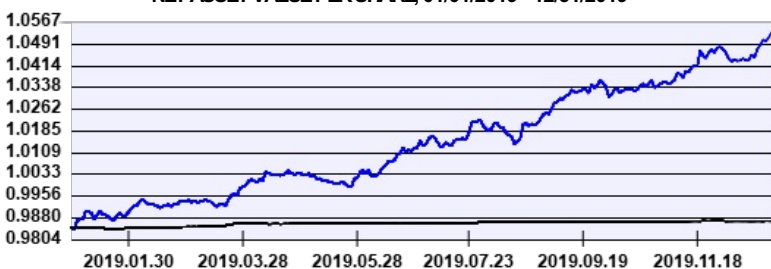
NET ASSET VALUE PER SHARE, 01/01/2019 - 12/31/2019

— Aegon Alfa Total Return Investment Fund EUR series — Benchmark