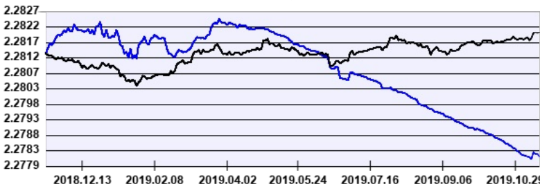
NET ASSET VALUE PER SHARE, 11/19/2018 - 11/18/2019

---- Aegon Money Market Fund HUF series - - - - Benchmark