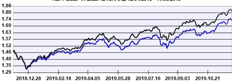
NET ASSET VALUE PER SHARE, 12/01/2018 - 11/30/2019

---- Aegon International Equity Fund HUF series - - - - Benchmark