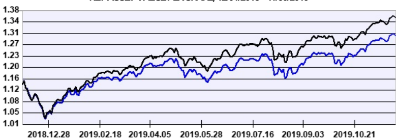
NET ASSET VALUE PER SHARE, 12/01/2018 - 11/30/2019

----- Aegon International Equity Fund EUR series - - - - Benchmark