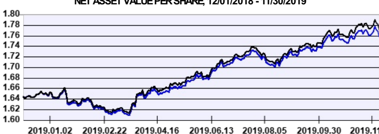
NET ASSET VALUE PER SHARE, 12/01/2018 - 11/30/2019

— Aegon Polish Bond Fund HUF series — Benchmark