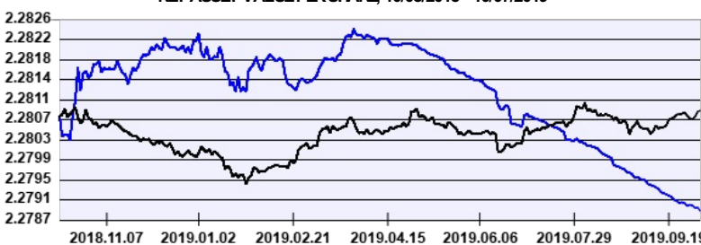
NET ASSET VALUE PER SHARE, 10/08/2018 - 10/07/2019

---- Aegon Money Market Fund HUF series - - - - Benchmark