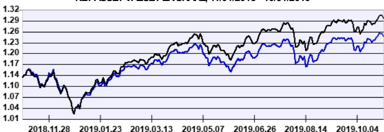
NET ASSET VALUE PER SHARE, 11/01/2018 - 10/31/2019

Past performance is no guarantee of future results. This report should not be considered as an offer or investment advisory. The Fund Prospectus contains the detailed conditions of the investment. The distribution costs of the fund purchase can be found at the distributors.