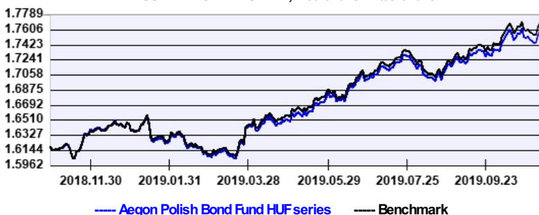
NET ASSET VALUE PER SHARE, 11/01/2018 - 10/31/2019

Past performance is no guarantee of future results. This report should not be considered as an offer or investment advisory. The Fund Prospectus contains the detailed conditions of the investment. The distribution costs of the fund purchase can be found at the distributors.