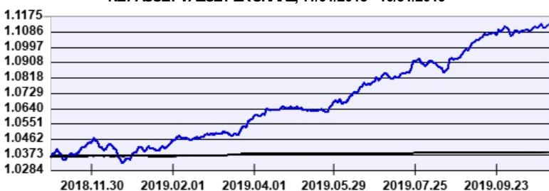
NET ASSET VALUE PER SHARE, 11/01/2018 - 10/31/2019

— Aegon Alfa Total Return Investment Fund USD series — Benchmark Past performance is no guarantee of future results. This report should not be considered as an offer or investment advisory. The Fund Prospectus contains the detailed conditions of the investment. The distribution costs of the fund purchase can be found at the distributors.