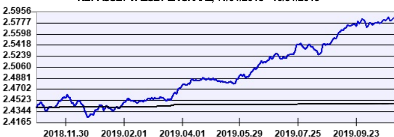
NET ASSET VALUE PER SHARE, 11/01/2018 - 10/31/2019

----- Aegon Alfa Total Return Investment Fund PLN series ----- Benchmark