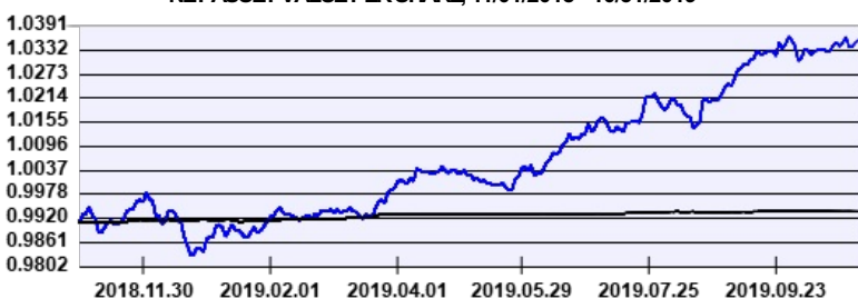
NET ASSET VALUE PER SHARE, 11/01/2018 - 10/31/2019

----- Aegon Alfa Total Return Investment Fund EUR series --- Benchmark Past performance is no guarantee of future results. This report should not be considered as an offer or investment advisory. The Fund Prospectus contains the detailed conditions of the investment. The distribution costs of the fund purchase can be found at the distributors.