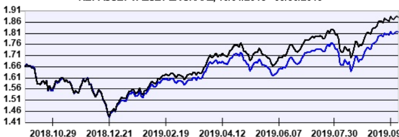
NET ASSET VALUE PER SHARE, 10/01/2018 - 09/30/2019

— Aegon International Equity Fund institutional series — Benchmark