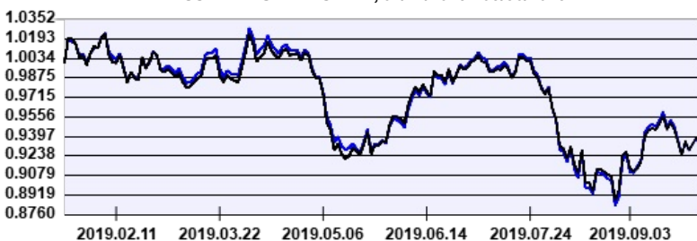
NET ASSET VALUE PER SHARE, 01/22/2019 - 09/30/2019

— Aegon Polish Equity Fund PLN series — Benchmark