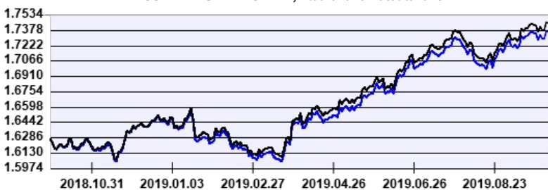
NET ASSET VALUE PER SHARE, 10/01/2018 - 09/30/2019

— Aegon Polish Bond Fund HUF series — Benchmark