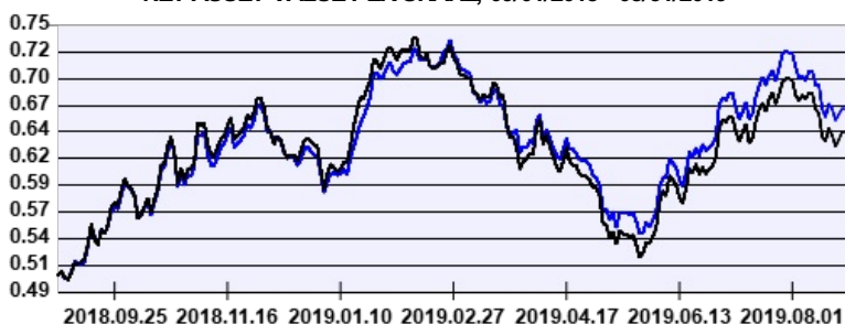
NET ASSET VALUE PER SHARE, 09/01/2018 - 08/31/2019

— Aegon Istanbul Equity Fund PLN series — Benchmark