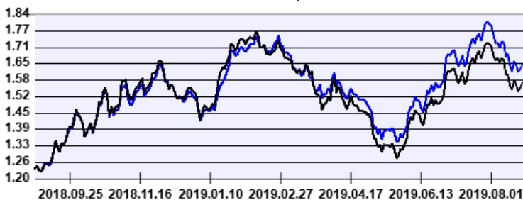
NET ASSET VALUE PER SHARE, 09/01/2018 - 08/31/2019

— Aegon Istanbul Equity Fund institutional series — Benchmark