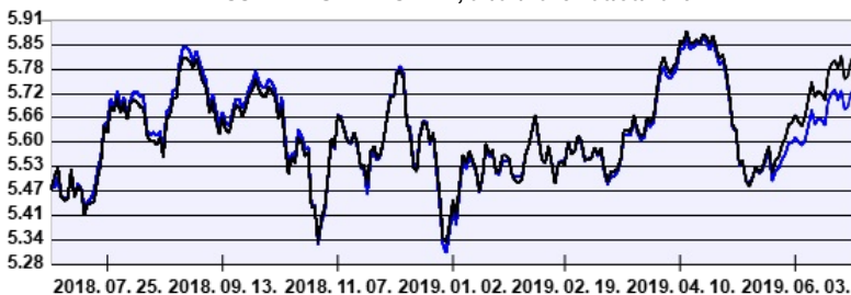
NET ASSET VALUE PER SHARE, 07/01/2018 - 06/30/2019