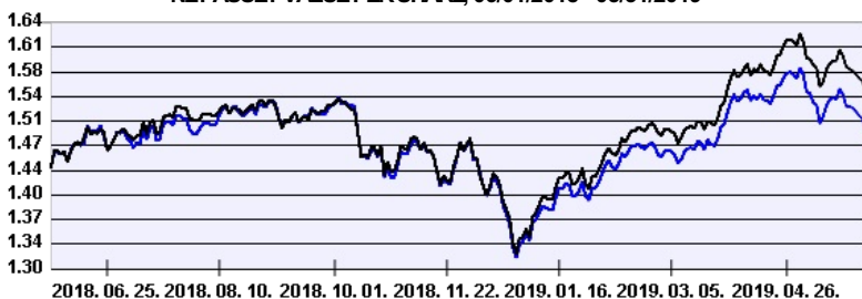
NET ASSET VALUE PER SHARE, 06/01/2018 - 05/31/2019

— Aegon International Equity Fund HUF series — Benchmark