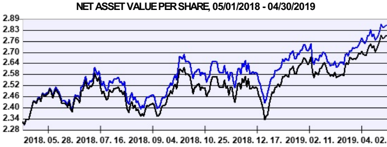
NET ASSET VALUE PER SHARE, 05/01/2018 - 04/30/2019

— Aegon Russia Equity Fund institutional series — Benchmark