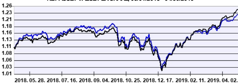
NET ASSET VALUE PER SHARE, 05/01/2018 - 04/30/2019

— Aegon International Equity Fund EUR series — Benchmark