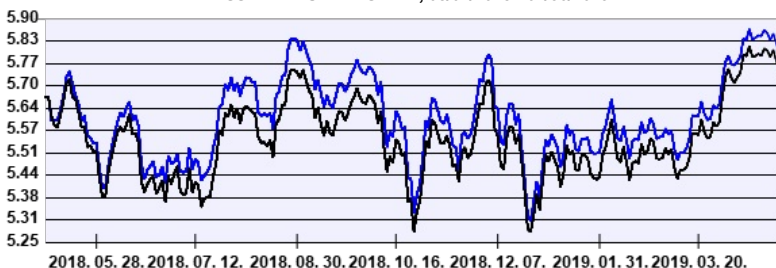
NET ASSET VALUE PER SHARE, 05/01/2018 - 04/30/2019

----- Aegon Central European Equity Fund HUF series ----- Benchmark