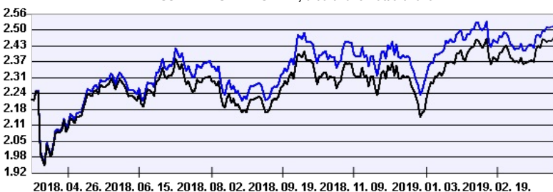
NET ASSET VALUE PER SHARE, 04/01/2018 - 03/31/2019

--- Aegon Russia Equity Fund HUF series --- Benchmark