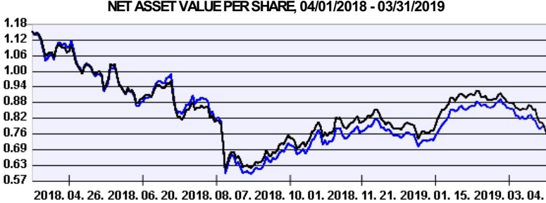
NET ASSET VALUE PER SHARE, 04/01/2018 - 03/31/2019

Past performance is no guarantee of future results. This report should not be considered as an offer or investment advisory. The Fund Prospectus contains the detailed conditions of the investment. The distribution costs of the fund purchase can be found at the distributors.